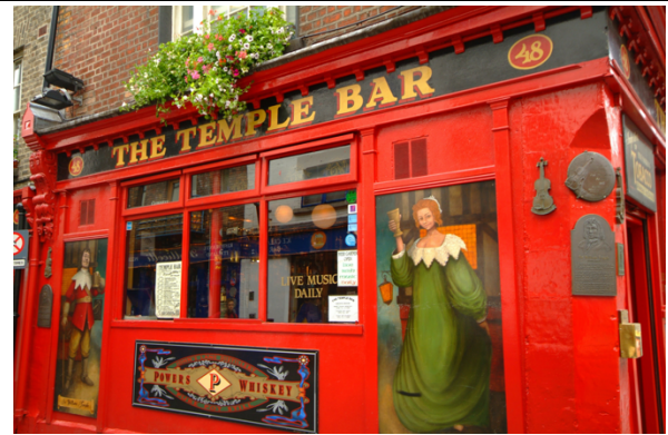
Temple Bar on the banks of the Liffey is a hive of activity with many pubs and restaurants to suit all tastes.

Dublin has dozens of other general and specialist tours for you to take. From the Viking Splash Tour to Literary Pub Crawl to personalised walking tour podcasts.