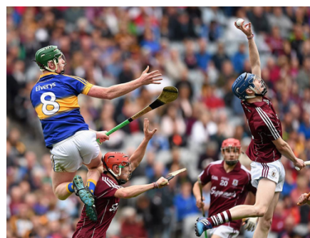
Hurling, one of the fastest (and perhaps most dangerous?) sports in the world

Football and Hurling Championship Finals – attract a capacity 82,300 fans, to witness the pinnacle of Gaelic games action in this world-renowned cathedral of sport. Note that this is a slight deviation next year from the traditional Friday/Saturday dates, which was necessary to secure the location, but we hope that it will give attendees an extra day to perhaps catch a game at this iconic venue and enjoy what Dublin has to offer