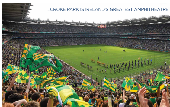
Match Day at the iconic Croke Park, home to the Gaelic Athletic Association