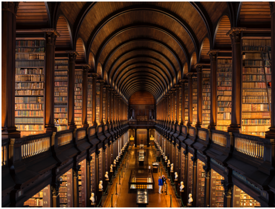
The beautiful Long Room in Trinity College Dublin.

Dublin's General Post Office or GPO , is a significant building on Dublin's main street, O'Connell Street, because of its role in Irish history. In 1916, during the so-called Easter Rising, launched by Irish republicans to end British rule in Ireland and establish an independent Irish Republic, the GPO was the headquarters of the uprising's leaders.