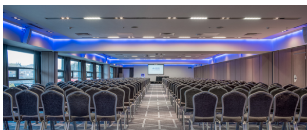
Conference facilities high up in the stadium.

Located just north of Dublin city centre, only 15 minutes from Dublin Airport, the venue, Croke Park, is the home of Ireland's largest sporting and cultural organisation, the Gaelic Athletic Association (GAA) which is celebrated as one of the great amateur sporting associations in the world. The GAA is part of the Irish consciousness and plays an influential role in Irish society that extends far beyond the basic aim of promoting Gaelic games. With a capacity of 82,300, Croke Park is Europe's third largest stadium after the Nou Camp in Barcelona and Wembley in London. It has played host to iconic moments in Irish sport & history and to major cultural and international events, not to mention international conferences.